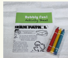
Coloring Page & Crayons